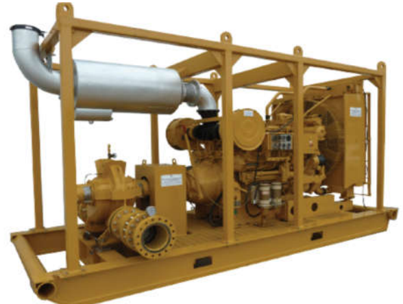
HIGH VOLUME PUMP UNIT

Additionally, the Pump provides trouble-free, high-capacity capabilities with outstanding operating efficiency.