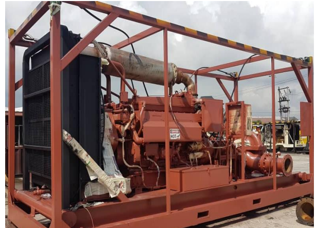
GOULD PUMP UNIT